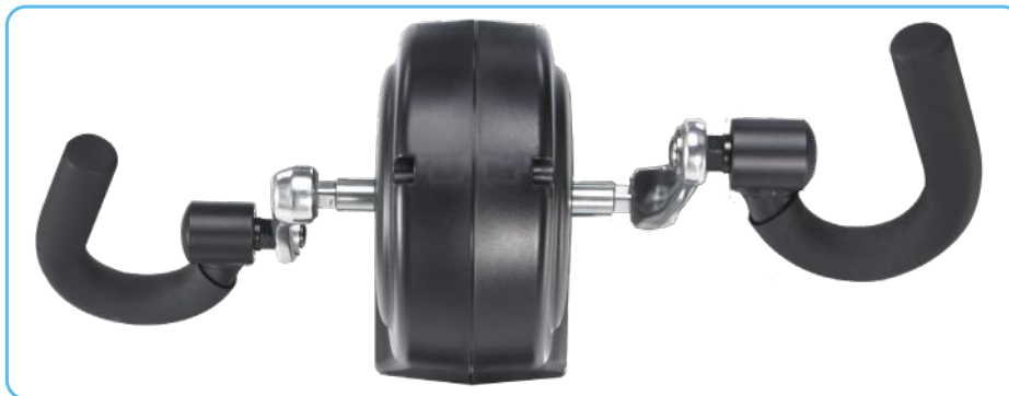
ERGONOMIC ROTATING HAND GRIPS