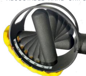
7 POSITIONS HORIZONTAL to VERTICAL