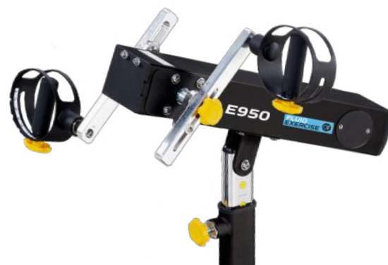
ADJUSTABLE CRANK HEIGHT - RANGE 530mm (20.83")