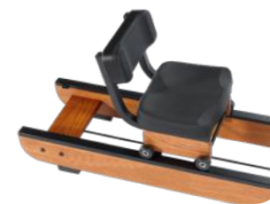
SEAT BACK KIT